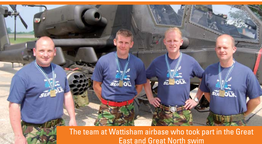
The team at Wattisham Airbase who took part in the Great East and Great North swim

We received tremendous support not only from trusts, foundations and local councils but also from many individuals. We really appreciate all their efforts whether it was taking part in the Great East Swim or bringing in unwanted clothes and books. It all adds up to an amazing total that really makes a difference to disabled people who rely on our services.