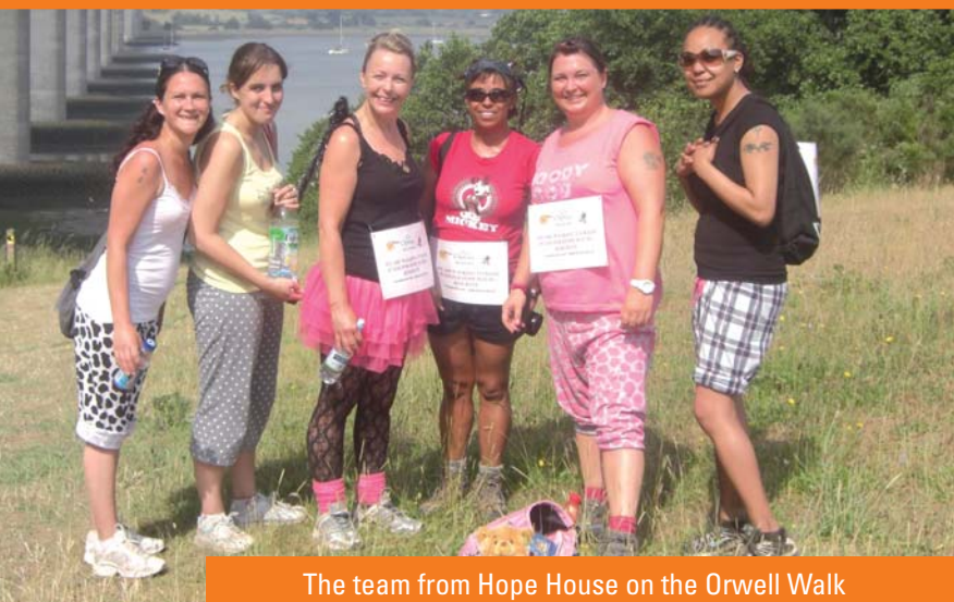
The team from Hope House on the Orwell Walk

Thank you to all the following who have contributed funding or contributed to our fundraising activities: