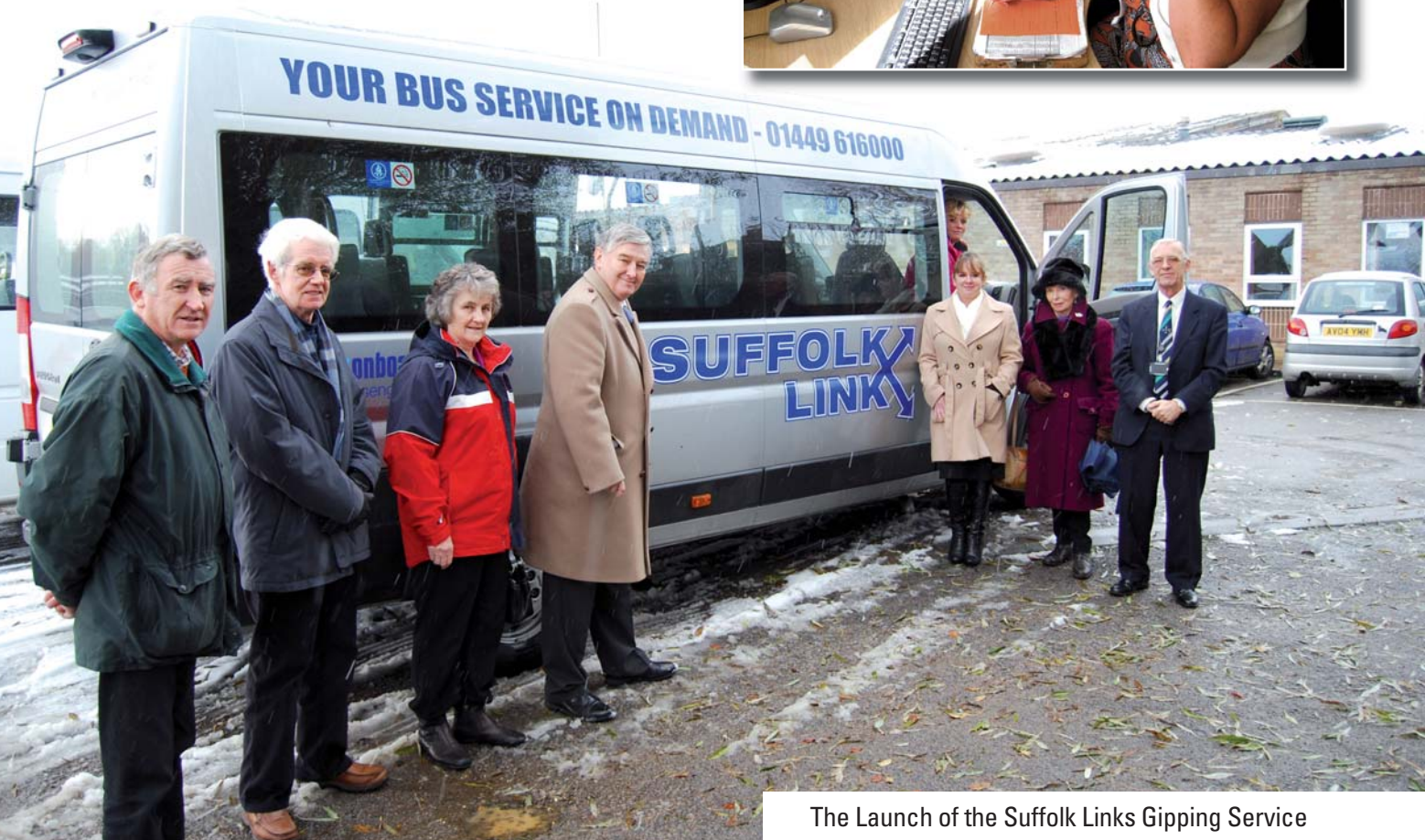
The Launch of the Suffolk Links Gipping Service