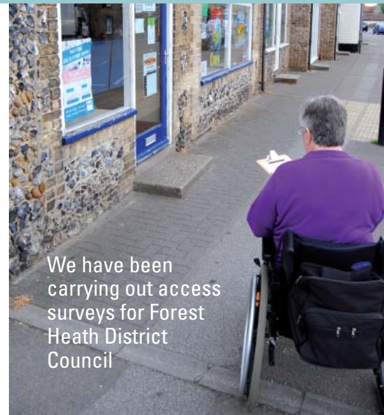
We have been carrying out access surveys for Forest Heath District Council

Optua is committed to the development of a fully inclusive environment for disabled people and works hard to raise awareness of accessibility issues. This means improving the access for wheelchair users, people who are visually or hearing impaired, people who are frail and elderly and people with learning disabilities.